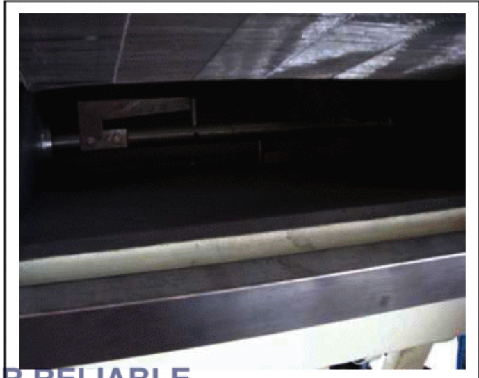
SMALL CHOCOLATE MIXING TANK