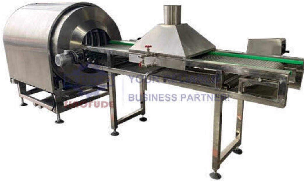
Sugar Coating Machine (Sugar Sanding Machine)